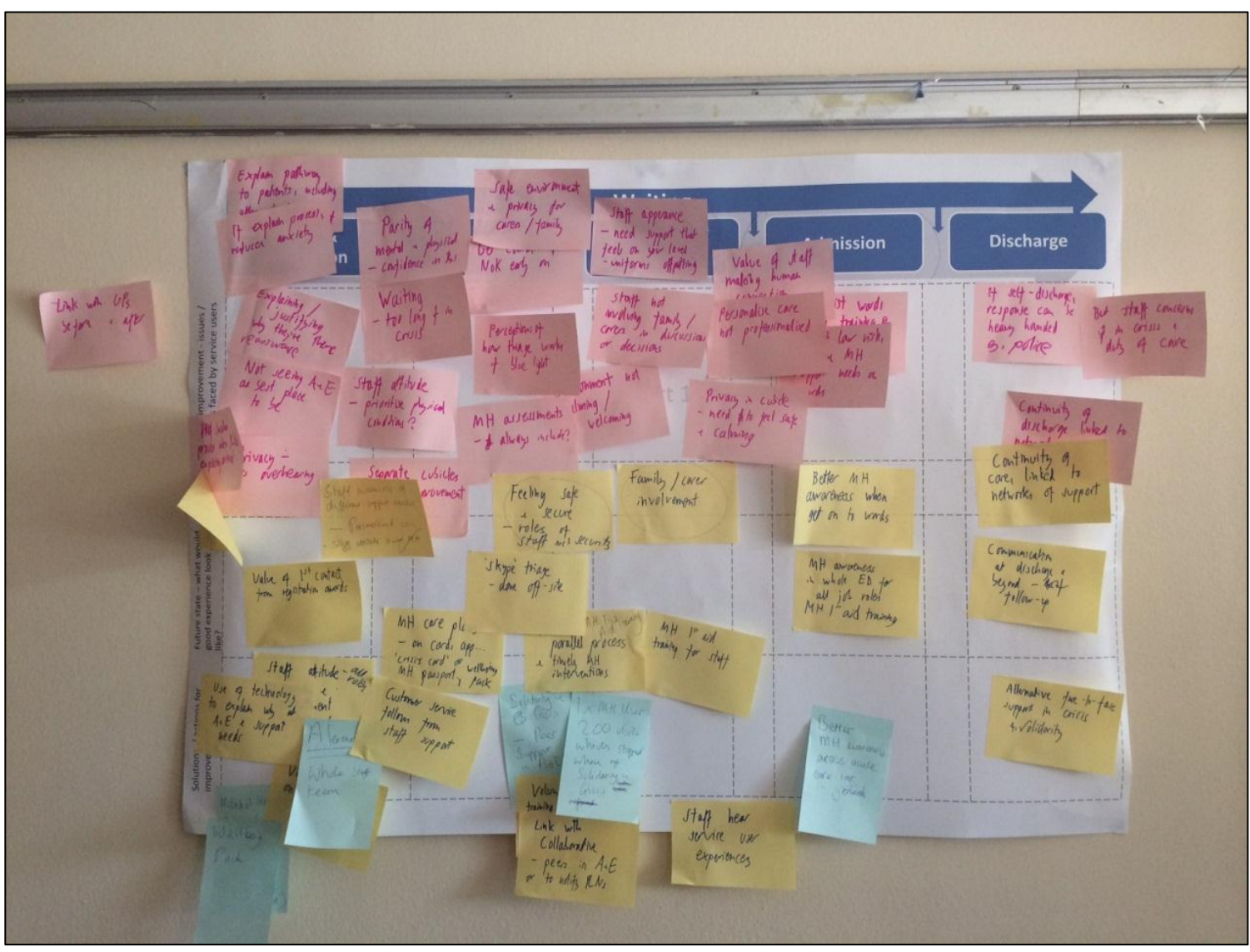
Page 3 of 8

This group looked at the interactions in A&E for people with mental illness. It looked at each stage from arriving at A&E through to discharge.